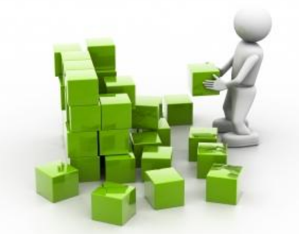
Sustainable Patients' Organisations